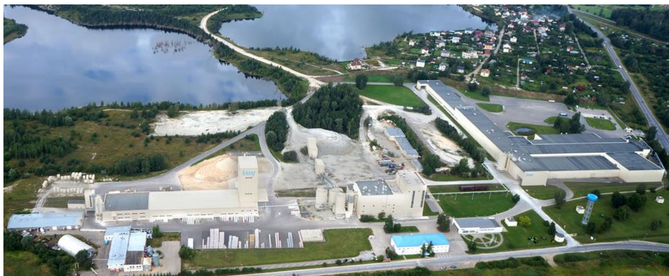
KNAUF Sauriesi, Stopinu novads production plant in Latvia

Name and location of production site KNAUF Sauriesi, Stopinu novads production plant in Latvia.